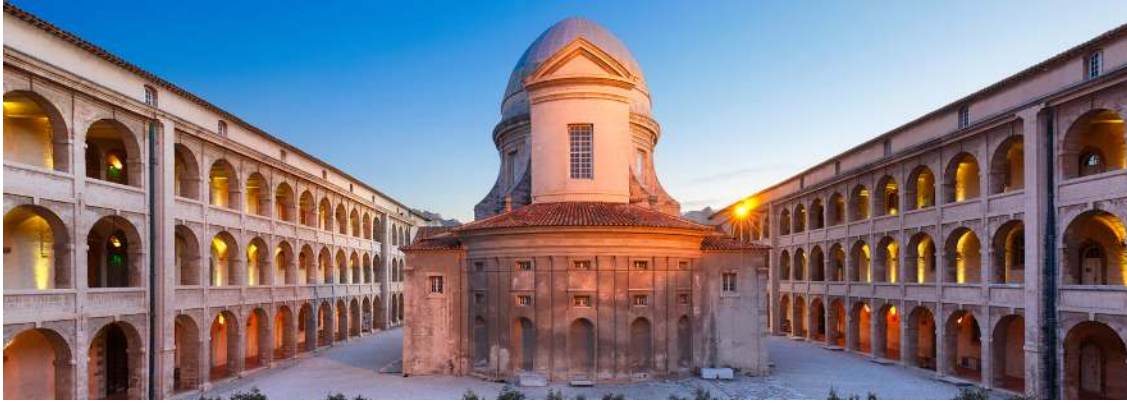
Centre de la Vieille Charité, Marseille