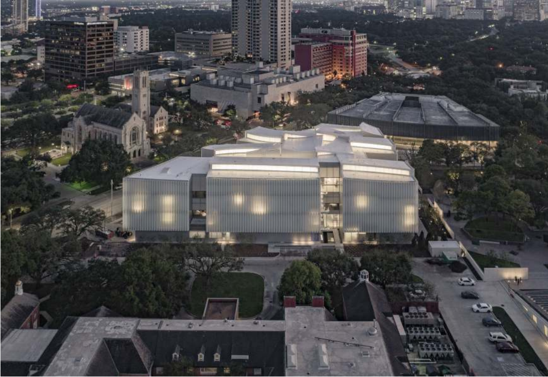
The Nancy and Rich Kinder Building at the Museum of Fine Arts, Houston.