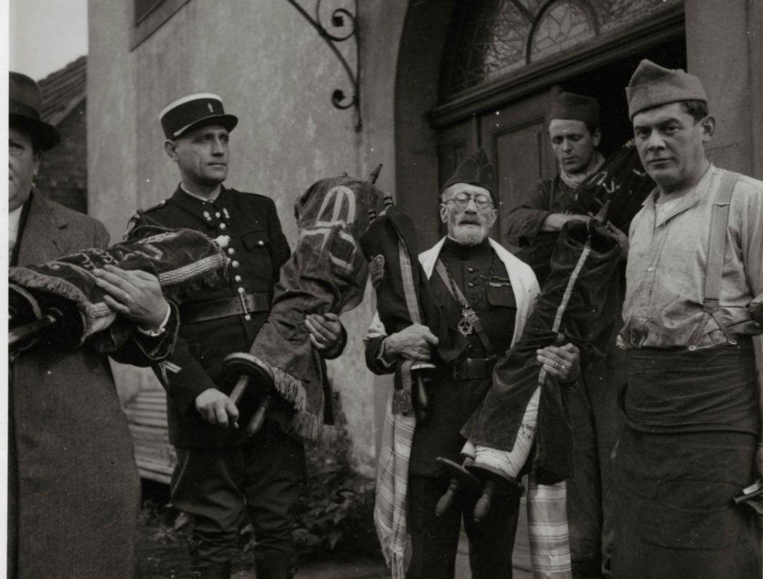
Evacuation of Jewish objects in 1939, gift Maréchal de Lattre, Historical Museum – Photo credit: Museums of Strasbourg, M. Bertola.