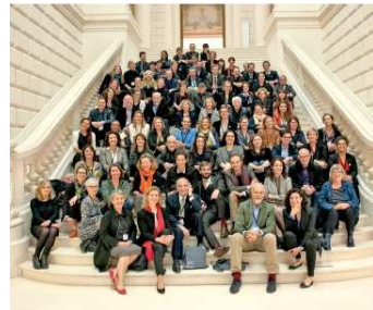
Congrès Annuel / Annual Conference, Nantes, 2018