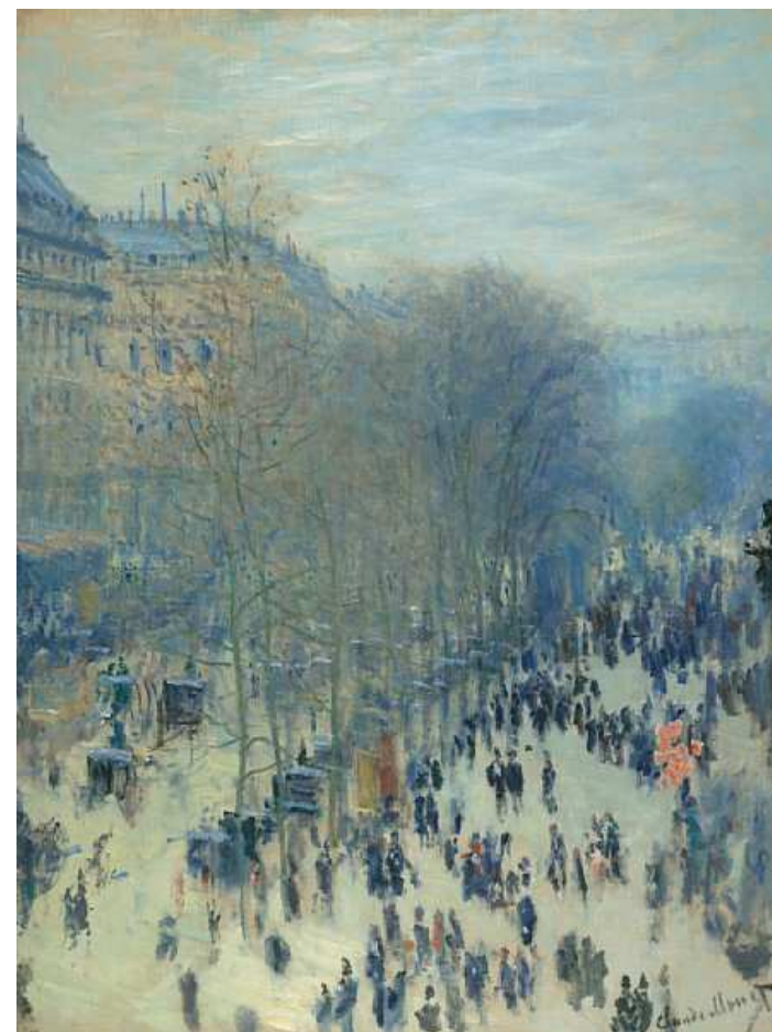
Claude Monet, French, 1840-1926, Boulevard des Capucines , 1873-1874, Oil on canvas, 31 5/8 x 23 3/4 in. (80.3 x 60.3 cm), Purchase: the Kenneth A. and Helen F. Spencer Foundation Acquisition Fund, F72-35