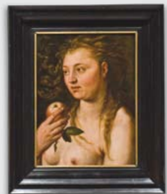
Eve, 1613 Oil on panel, Musée des Beaux-Arts, Strasbourg, France, inv.1450.