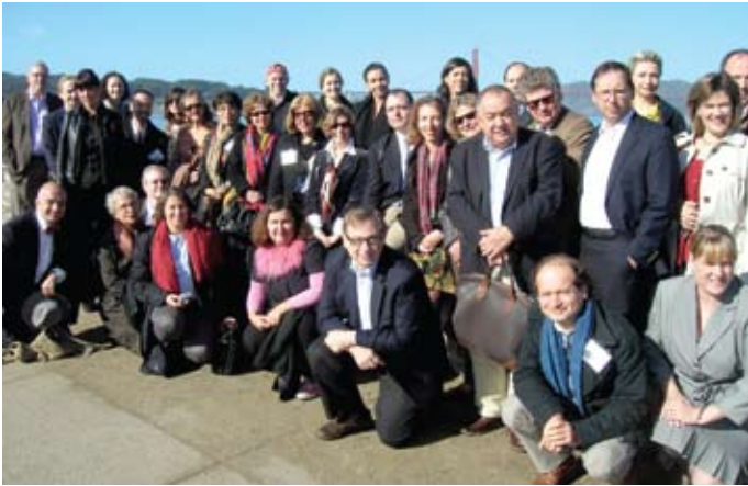
FRAME members enjoying the perfect fall weather in San Francisco.