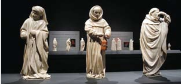
Installation of The Mourners at the Saint Louis Art Museum.