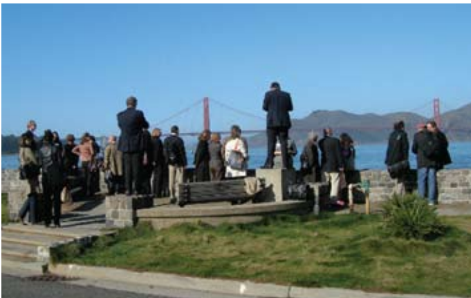
FRAME members enjoying the San Francisco Bay and the view of the Golden Gate Bridge.