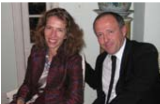
Top: Mayor of Dijon, François Rebsamen at the Metropolitan Museum of Art.