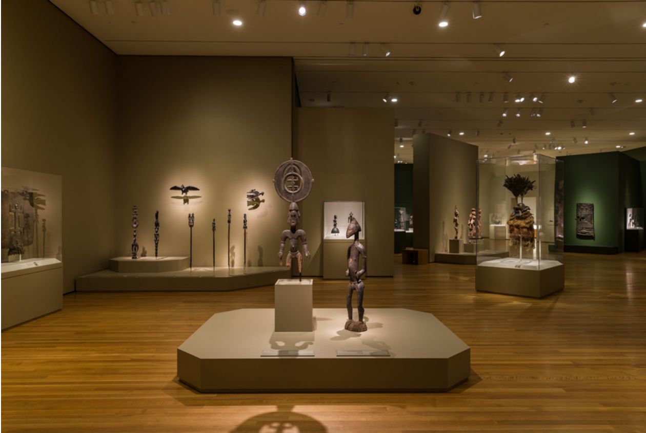
© Senufo: Art and Identity in West Africa Installation Images. Images by David Brichford, Courtesy of the Cleveland Museum of Art

First African Art exhibition under the auspices of FRAME