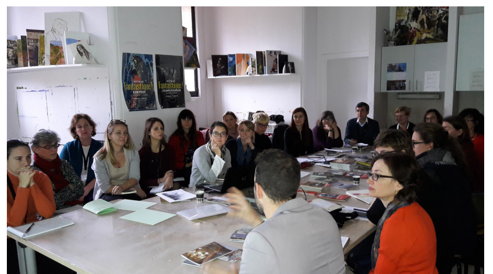
Educators meeting at the Petit Palais