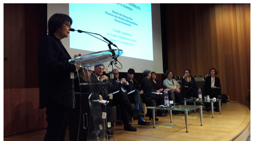
Panel discussion at the Petit Palais