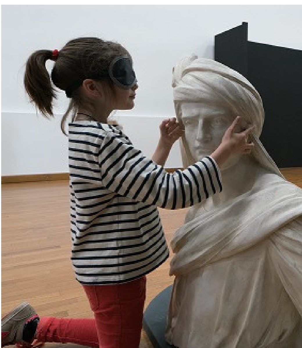
© Musée Fabre - Tactile Gallery

The tactile gallery is intended to circulate in other museums of the FRAME network.