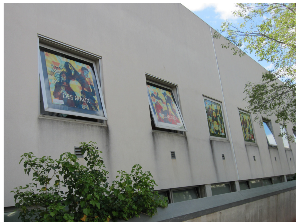
CCR posters made by students from Montpellier with Street Art artist Sunny Jim, stuck on the windows of Collège Las Cazes