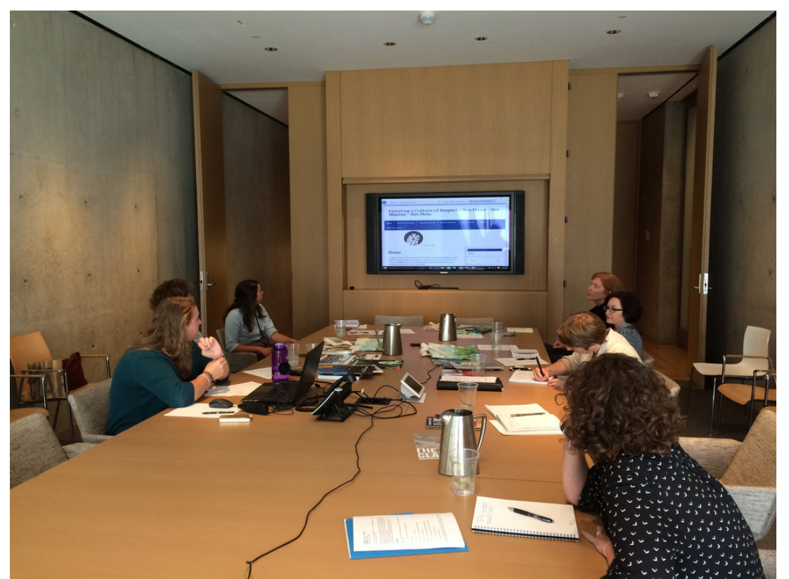
Classroom session discussing the website of "Curating a Culture of Respect" for participants to collaborate on.