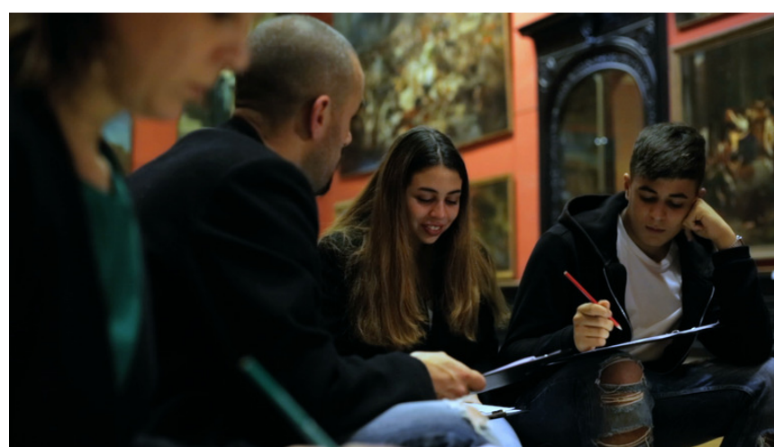
Toulouse © Gilles Thomat