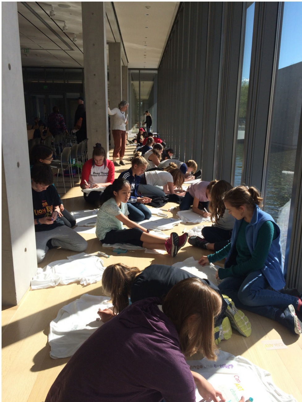
Students creating t-shirts at the Clark, Williamstown, MA