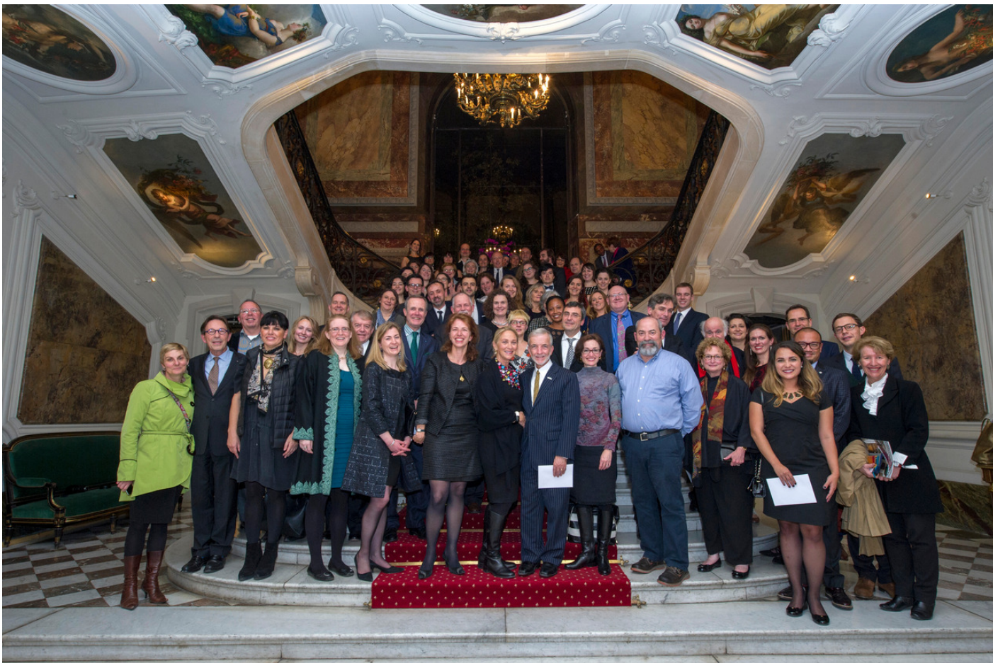
At the Cercle France-Amériques in Paris