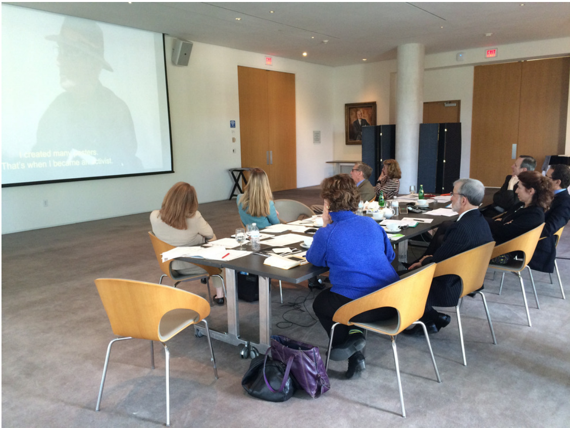
The Board watching the documentary on Curating a Culture of Respect produced in Strasbourg