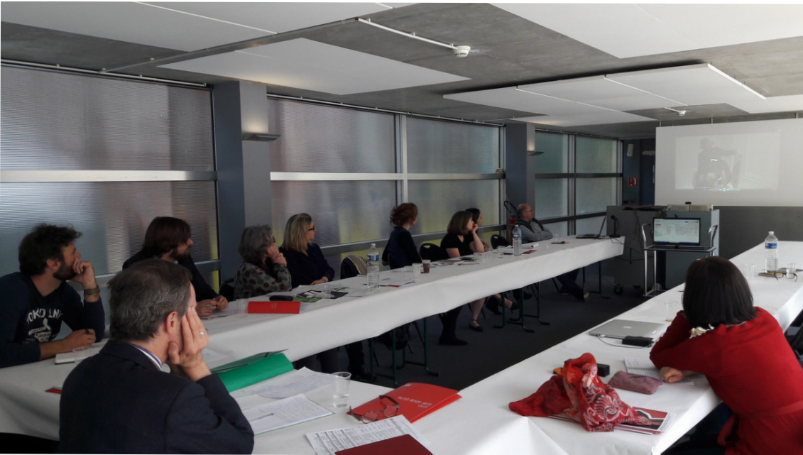
Workshop at the Palais des Beaux-Arts of Lille