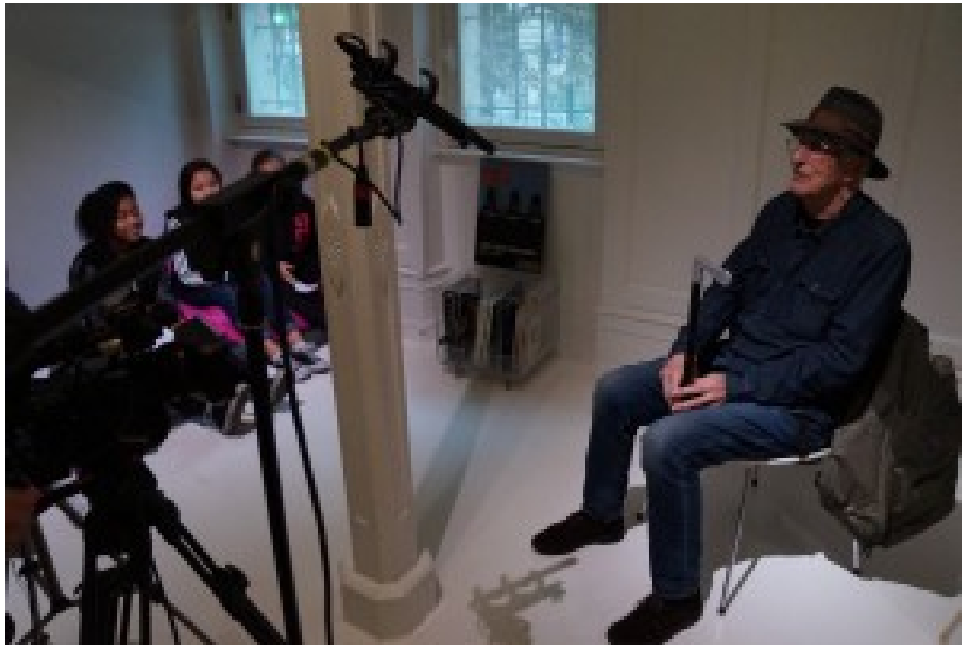
Interview of Tomi Ungerer by Hans Arp students for a film about CCR

The overall goal of this project is for young people to become more aware of the dynamics of violence in our world and their power to shape a healthier future. The project involves coordinated educational experiences in art museums and schools including a forum for cross-cultural communication around the experience and the issue of violence.